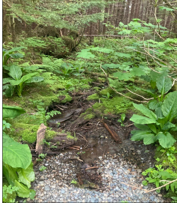
Figure 3.—Downstream at waypoint 265.