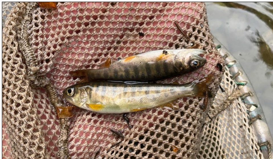
Figure 1.–Juvenile coho salmon caught at waypoint 265.