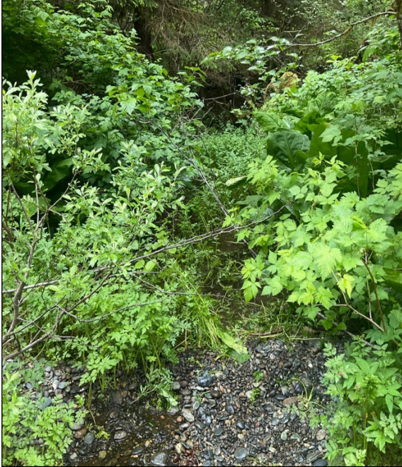
Figure 2.—Upstream at waypoint 265.