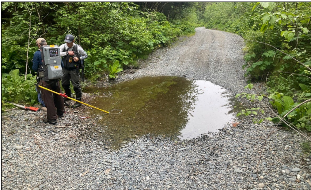
Figure 4.—Impounded water on the road at waypoint 265.